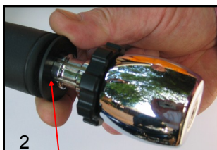
2 Thrust Washer—recess Facing Throttle Sleeve