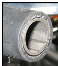
1 Bar End Cap Removed