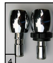
4 Kit comprises: LHS & RHS weights