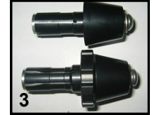
Left Hand Bar weight and Right Hand Throttle Control

DISCLAIMER: NO RESPONSIBILITY ACCEPTED FOR NON-ADHERENCE TO THESE INSTRUCTIONS